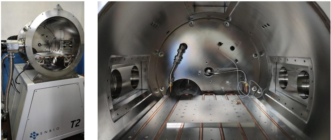
Figure 1. ENBIO T2 test facility. Left: overview photograph. Right: inside of chamber, showing a typical thermal adapter plate screwed in position on the thermal platen.

The ENBIO T2 thermal vacuum test facility is located at the ENBIO R&D lab in Glasnevin, Dublin 11, Ireland, just 15 minutes away from Dublin Airport.. This facility utilises a 60 cm internal diameter high vacuum chamber with an internal length of 66 cm (see Figure 1). The chamber contains an aluminium thermal platen, through which a cryo-fluid is circulated. The thermal platen is supported by four PEEK (polyether ether ketone) blocks to thermally isolate the platen from the chamber walls. Temperature control of the cryo-fluid is achieved using a dedicated commercial cryo-chiller with 3.0 kW of heating power and \approx 3 kW of cooling power (3.8 kW at 100 °C, 3.7 kW at 0 °C, 2.2 kW at -60 °C, 0.7 kW at -80 °C). A PT100 resistance temperature detector (RTD) connected to the thermal platen close to the TRP position is used for feedback control by the cryo-chiller. The cryo-chiller has programmable over-temperature and under-temperature limits to prevent damage to test articles by temperature excursions. No thermal shroud is present inside the chamber.